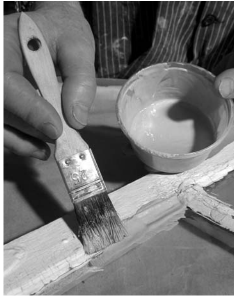
Figure 5 Liquid putty is brushed into small cracks in the front putty. This is a simple measure to delay ageing.

into the wood. Our records show that the putty remains waterproof even after 20 years. Linseed-oil putty can be stored in a cool place. Old, hard linseed-oil putty can be refreshed in a few seconds in the microwave. The putty can be frozen for long-term storage. Knead the whole lump of putty until soft before use. It is easiest to apply putty at room temperature. The putty should be painted over, and is ready for painting immediately or the next day. A looser mixture can be obtained by adding a few drops of oil or turpentine to the putty and this can be used for temporary sealing of split putty grooves (Figure 5). Use a brush and wipe dry with paper after about 15 minutes. The surface can be painted over directly.