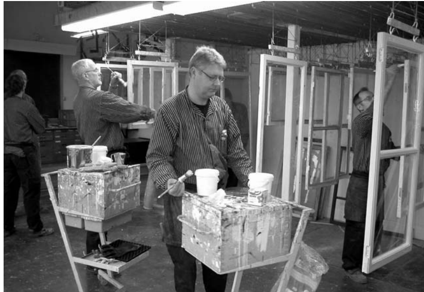
Figure 4 Students at Bjäresjö School, Ystad learning how to use solvent-free linseed-oil paint manufactured by local raw flax material.