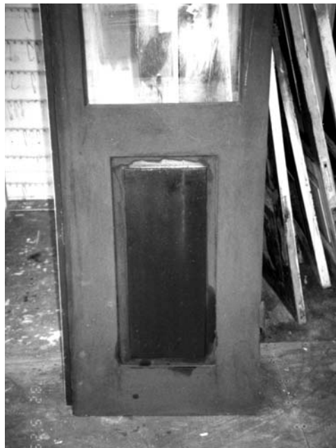
Figure 3 Maintenance of an old door, after nine years, with boiled linseed oil or linseed-oil wax.

Depending on position and exposure, maintenance is usually simple. Just clean the surface with, for example, ammonia or ethanol and let it dry. A brass brush can also be used. If the surface is brushed and cleaned and fresh boiled linseed oil or linseed-oil wax is applied, the surface will regain its former gloss and function (Figure 3). In the case of surfaces that are painted white, add a little white-colour pigment (titanium dioxide) to avoid the surface yellowing.