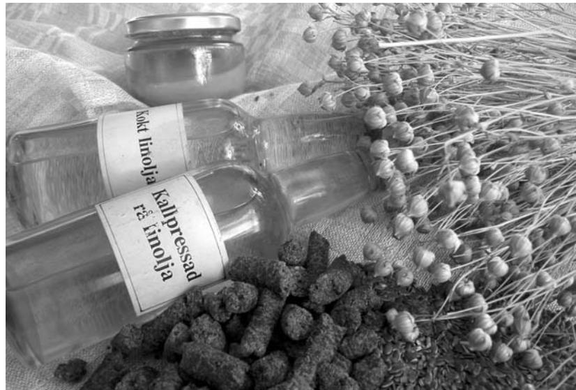
Figure 2 Flax, seeds, linseed pellets, and linseed-oil impurities.